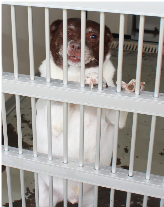
Charlie Brown is a unique dog that requires special care, making adoption unlikely. To prevent him from spending the remainder of his life in a kennel, the shelter is building a sanctuary just for Charlie.