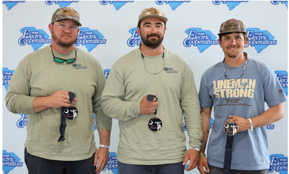
SEC’s journeyman team earned third place in the Vertical Line Transfer event.

This year, competitors didn’t know what events they would face until the morning of the competition, adding an extra layer of anticipation and