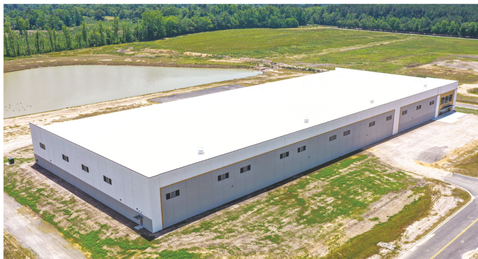
The 100,000-square-foot speculative building in Scranton Industrial Park has attracted several prospective buyers.