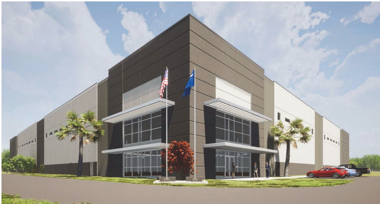
Santee Electric is involved in several new developments currently underway or being considered. In design are a 100,000-square-foot building in Georgetown (above) and a 105,000-square-foot-building in Clarendon County (left).