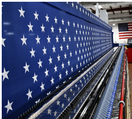
Embroidery Solutions specializes in star fields, the embroidered stars on the blue background of the American flag.